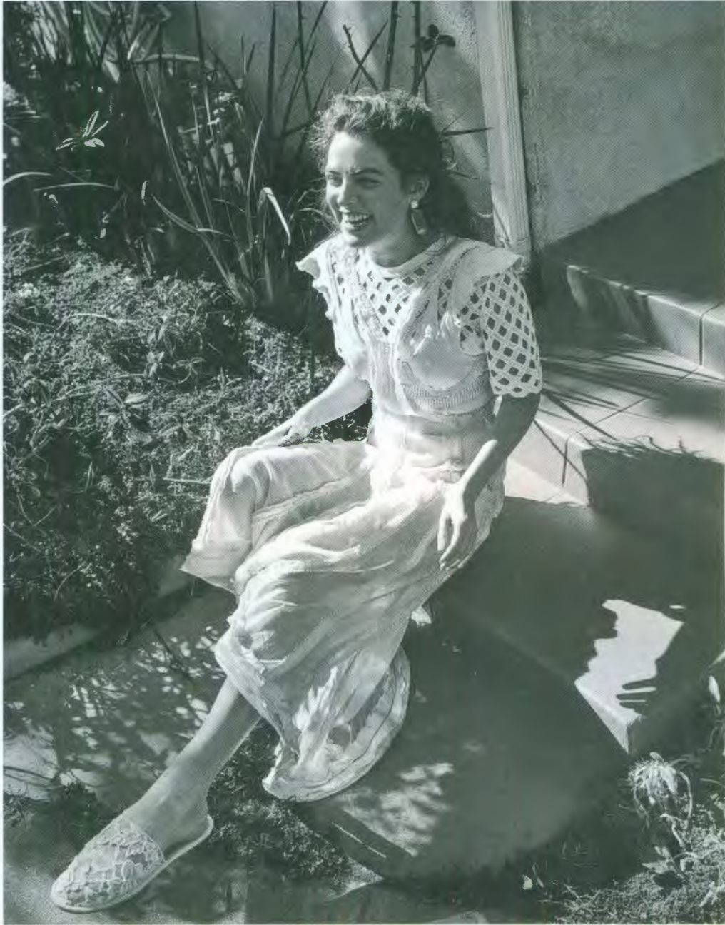
BALENCIAGA dress, earrings, and slippers and SANDRO lattice top.