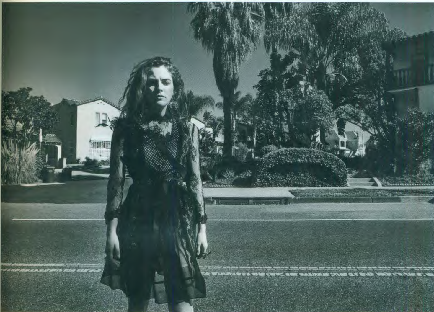
SANDRO dress, TOPSHOP lace top, MIU MIU feather and crystal ribbon necklace, PRADA globe earring, and H&M metal earring.

that gets a reaction out of people, whether that's good or bad, and we know the topic [escorting] can be whatever it is to people, but the topic wasn't the point of the show, it was more about Christine engaging in this enterprise, rather than coming from a 'bad background' or some kind of oppression. It's not a sad story. It was more of a character study for me, and Christine's job, both in law and in escorting, is a part of that. It tells a lot about her.