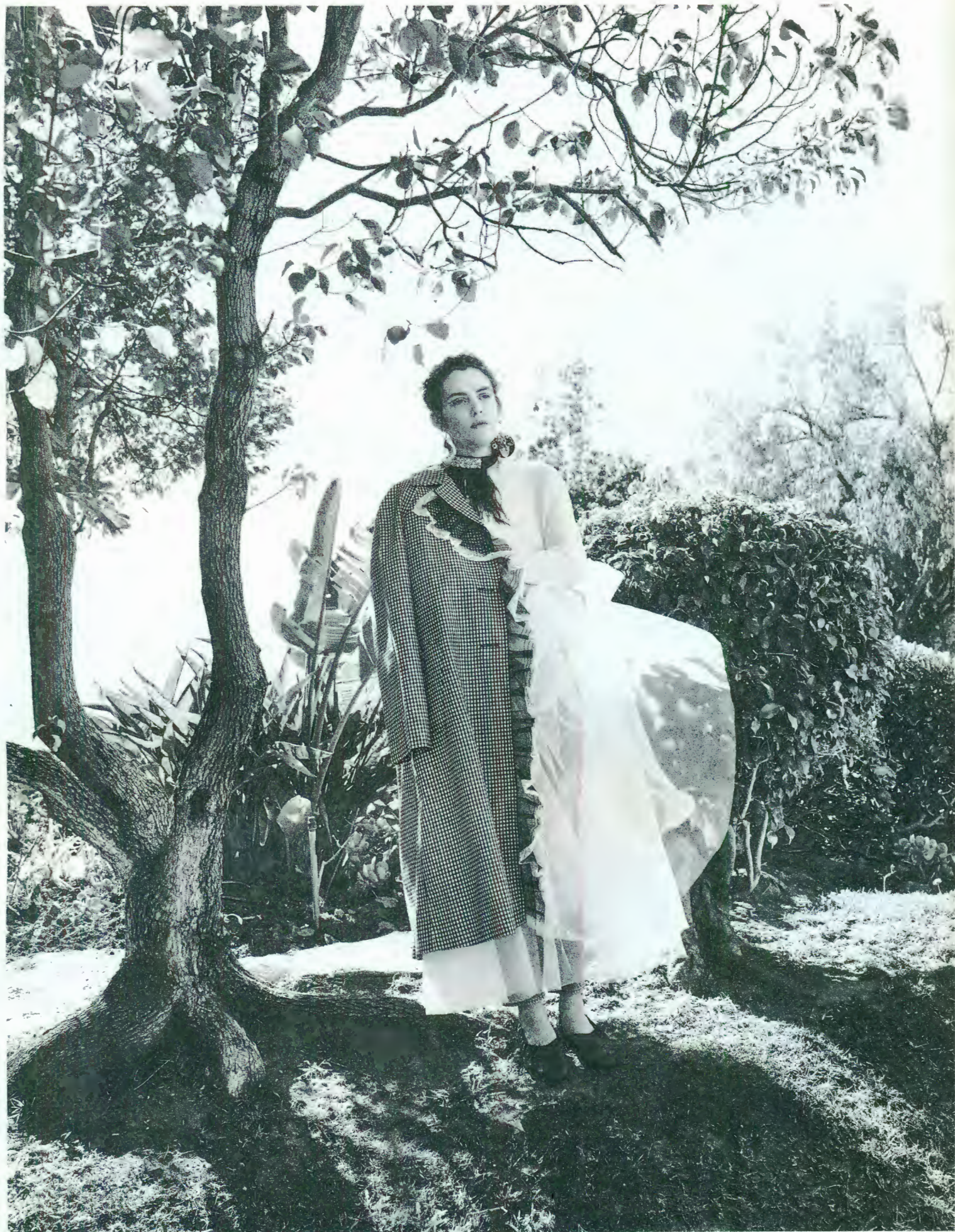
MIU MIU coat, tulle skirt, and feather and crystal ribbon necklace, SANDRO sweater and jeans, LANVIN ballet flats, PRADA globe earring, and H&M metal earring.